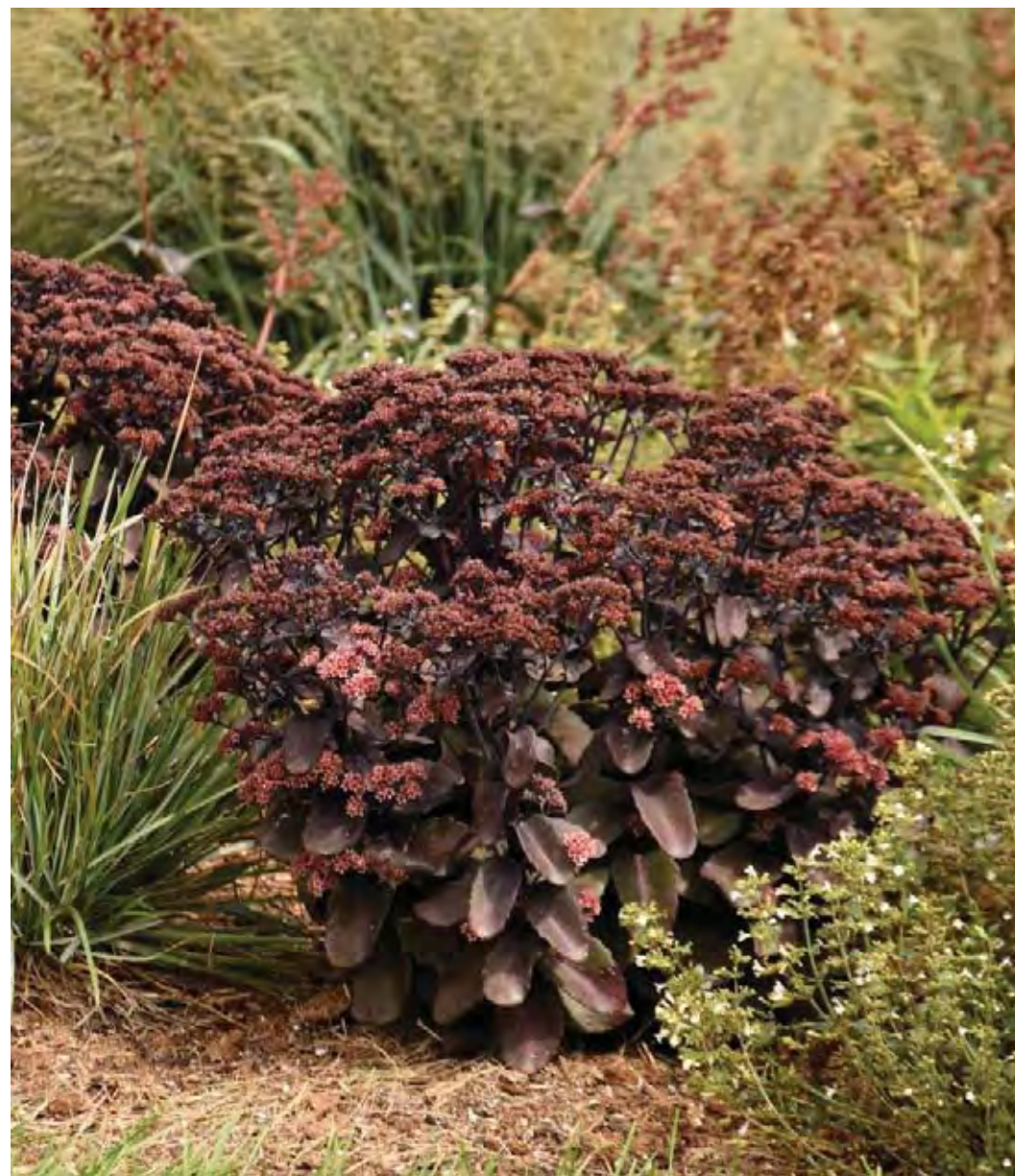
‘Back in Black’