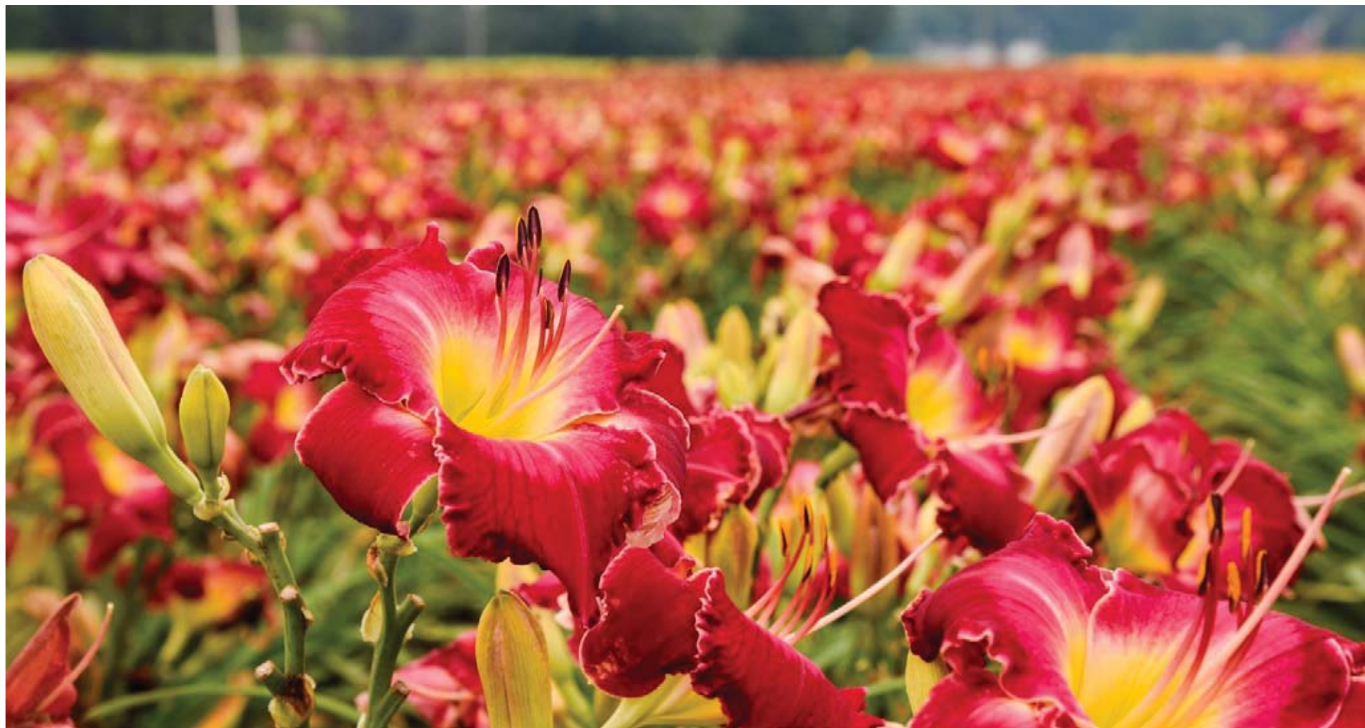
‘Blood, Sweat and Tears’ in the field