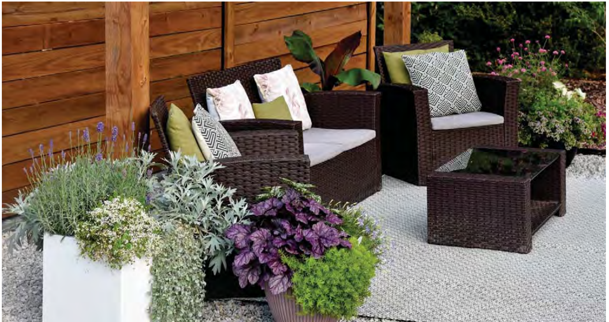
Mixed Perennial and Annual Containers