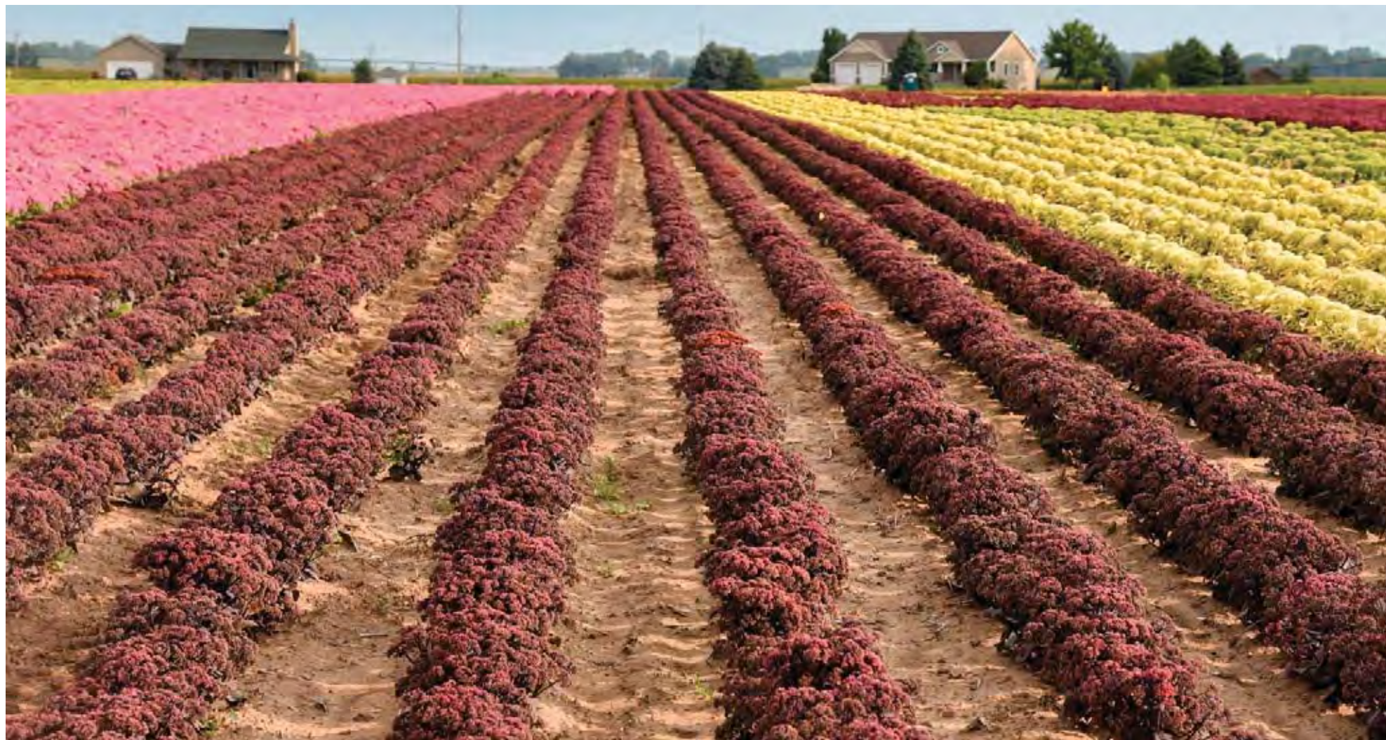
‘Midnight Velvet’ in the field