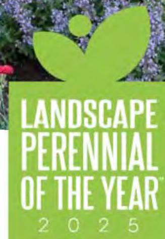
'Cat's Meow' Nepeta faassenii