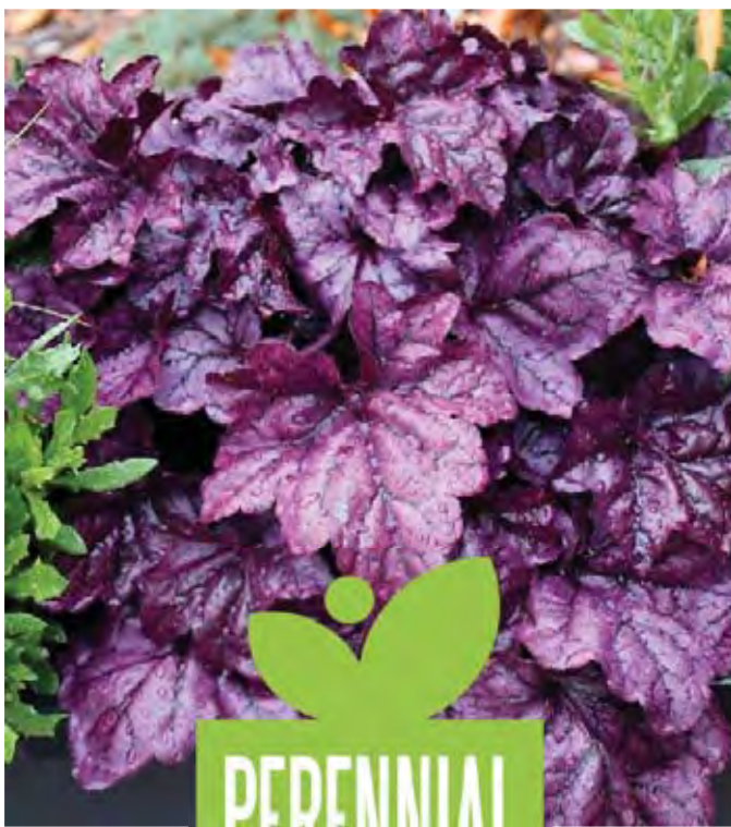
DOLCE® 'Wildberry' Heuchera