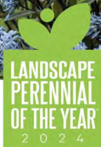
'Storm Cloud' Amsonia tabernaemontana