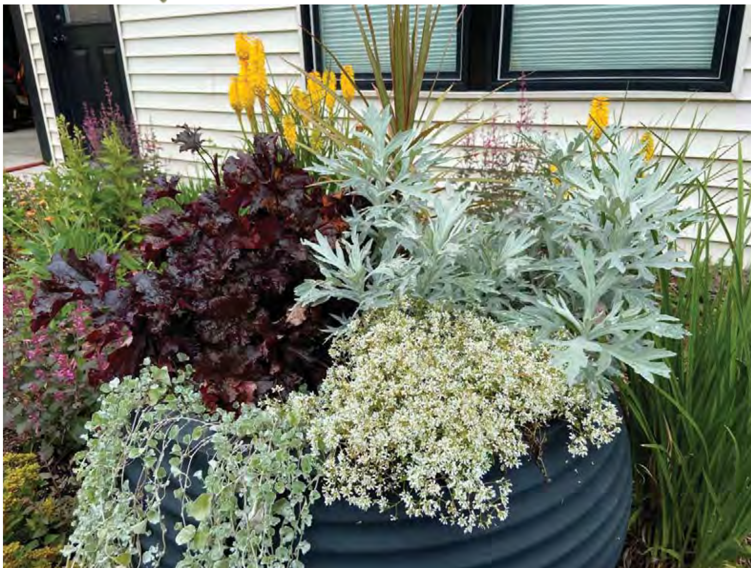
Mixed Perennial and Annual Containers