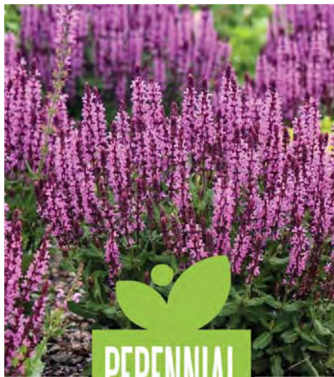
'Pink Profusion' Salvia nemorosa