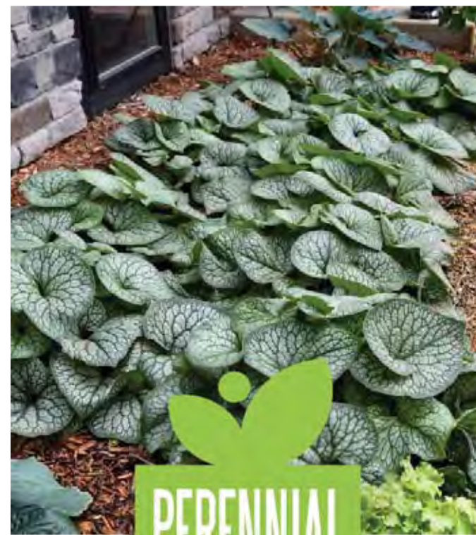
'Jack of Diamonds' Brunnera macrophylla