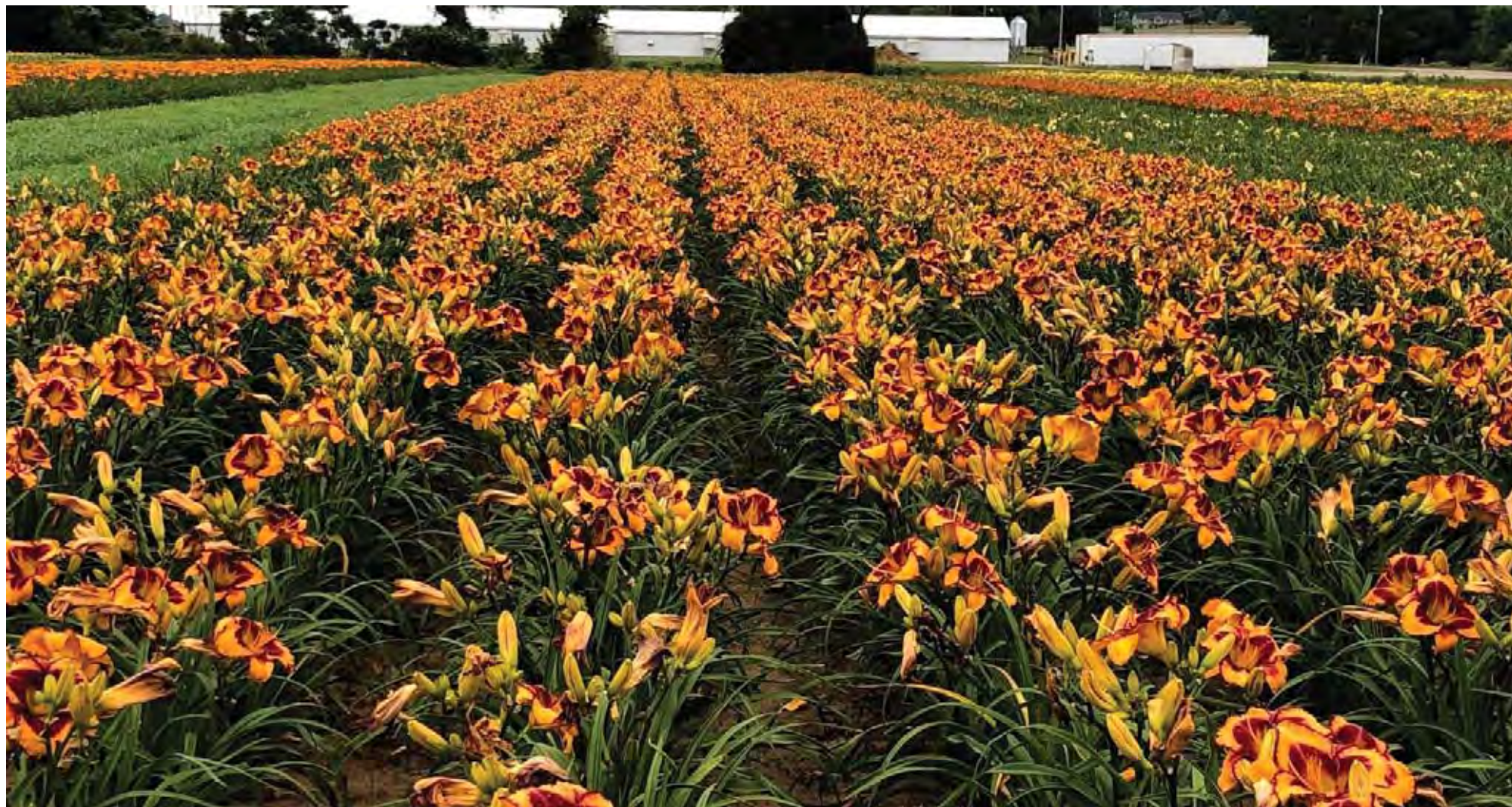
‘Blazing Glory’ in the field