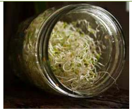
Sprout / 3 days (in darkness)