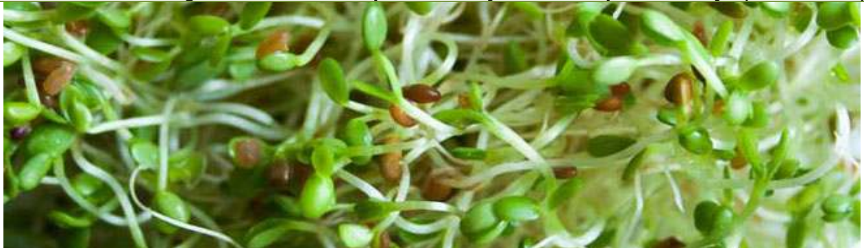
Sprout / 5 days (put in light on the 4th day)