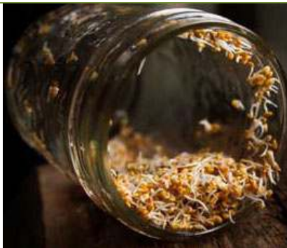
Sprout / 1 day