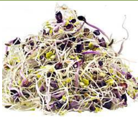
Sprout / 5 days