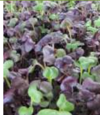
Shoot / 8 days