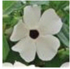
White with Eye