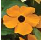
Orange with Eye