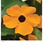
Orange with Eye