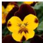
Sunshine 'N Wine