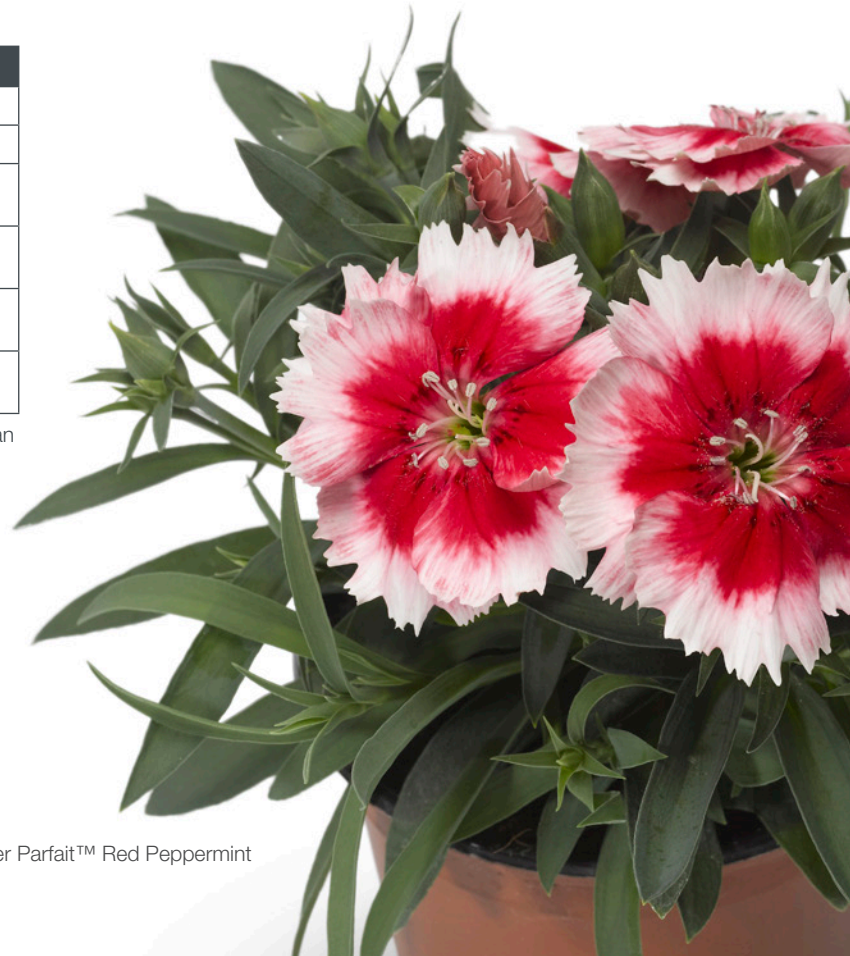
Super Parfait™ Red Peppermint